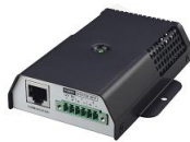
EMD for SNMP Manager Environmental Monitoring Device Monitor Temperature & Humidity Datasheet: Link Item No.: 10120544