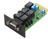
AS/400 Card Datasheet: Link Item No.: 10120515