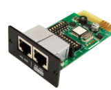
Modbus Card Datasheet: Link Item No.: 10120565