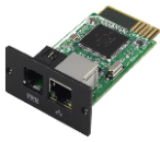
SNMP manager Datasheet: Link Item No.: 10120505